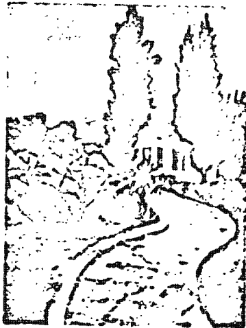
Сочи. Домик Н. А. Островского