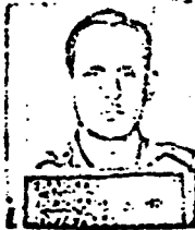
Photo taken circa 1945 after return to U.S. as wounded POW