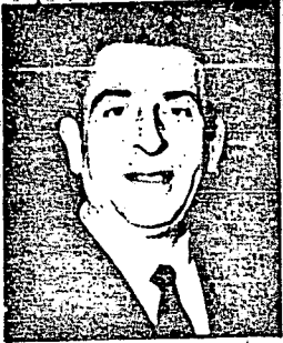
EDUARDO FREI President of Chile, Latin America's Christian Democratic leader.