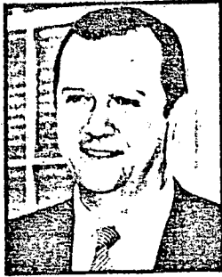
RAFAEL CALDERA Venezuelan presidential aspirant and number-two Latin American Christian Democrat