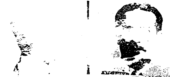
1935 Jerry SPARKING, A... red h'd, bro eyes, black CO-NAV, NYC B-55642