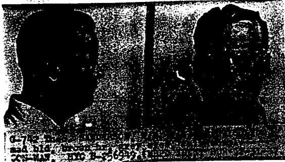
G-7 red h'd, bro eyes, black CO-NAV, NYC B-55642