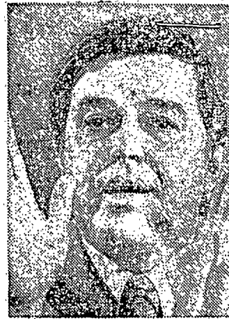
Sen. Frank Church ... meets with Ford

The reformers complain that officials of the CIA, Defense Intelligence Agency, Federal Bureau of Investigation, National Security Agency and others have seen the last year as merely a "damage control exercise" and have not faced the reality that Ford and Congress plan to make permanent, fundamental changes in their operations.