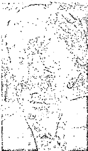
PETER CAMEJO A simple request

simple request to close down a Telegraph avenue intersection for a rally in support of striking French students.