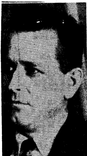
SUSPECT —The FBI released newly obtained photographs of James Earl Ray, the ex-convict sought in the slaying of Dr. Martin Luther King Jr.

(Indicate page, name of newspaper, city and state.)