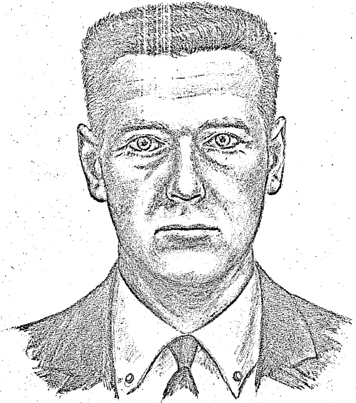
ARTIST'S SKETCH OF UNSUB.