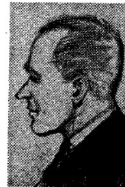
Artist's sketch of

"One of them get out of the wa he believed the or a Puerto Ric