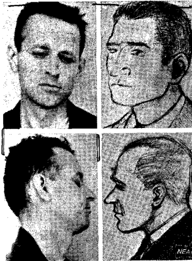
WANTED by the Federal Bureau of Investigation in the murder of Dr. Martin Luther King Jr. is James Earl Ray, alias Eric Starvo Galt. Prison photos of Ray, above left, are shown in comparison with artist sketches made from witnesses' descriptions of a man seen fleeing the house from which the fatal bullet was fired.