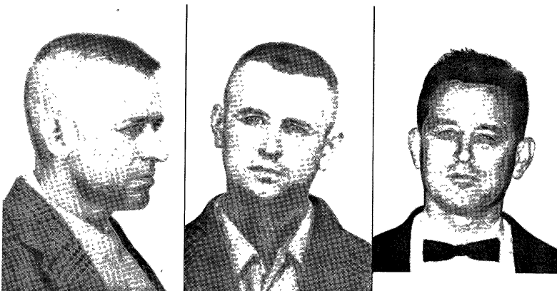
Photograph taken 1968 (eyes drawn by artist)