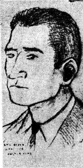
ARTIST SKETCH From Memphis

fused requests for composite drawings of the man they are seeking in what is perhaps the most massive manhunt in modern times. They even re-