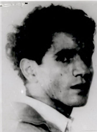
SIRHAN BISHARA SIRHAN, male, Arab, born 3/19/44 Jerusalem, 5'3", 120 #, brown hair, brown eyes