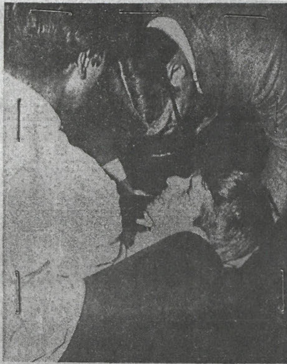
POOL OF BLOOD — Sen. Robert F. Kennedy lies on floor of anteroom just off main ballroom of Ambassador Hotel after being shot early Wednesday.

Pg.1 San Jose Mercury San Jose, Calif. 6-5-68