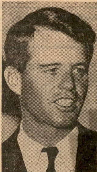
ROBERT F. KENNEDY "He'll be an easy target"

"Something has to be done about that little S.O.B., Bobby Kennedy," a top teamster official was quoted as saying. "He'll be an easy target, always driving around Washington in that convertible