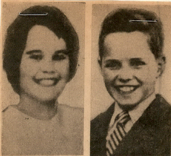
KATHLEEN AND JOE KENNEDY A warning overheard