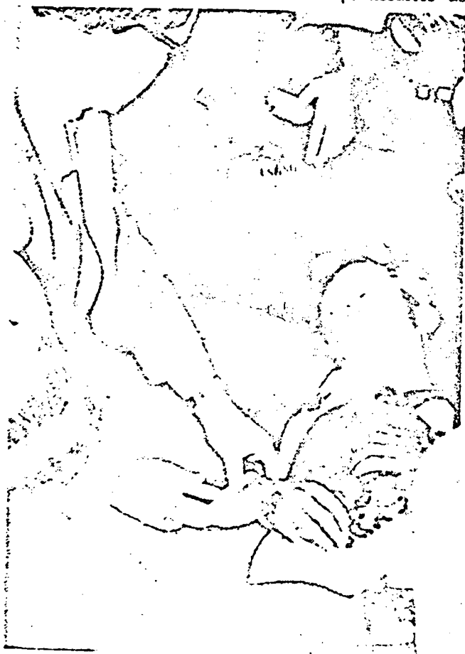
RFK KILLING: Fatally wounded with a bullet in his brain, Senator Kennedy clutches Rosary beads. His wife's arm and part of her head can