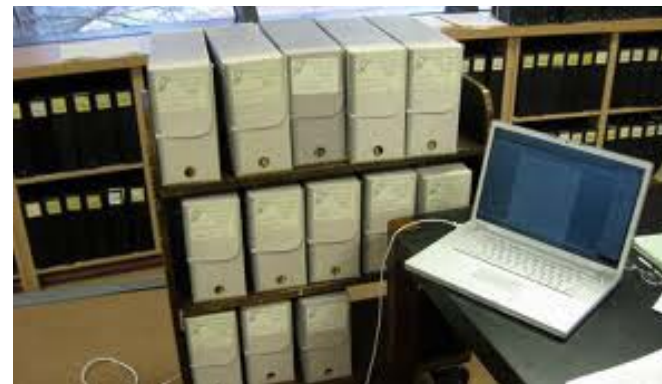
Jimmy Carter Presidential Library Atlanta, GA