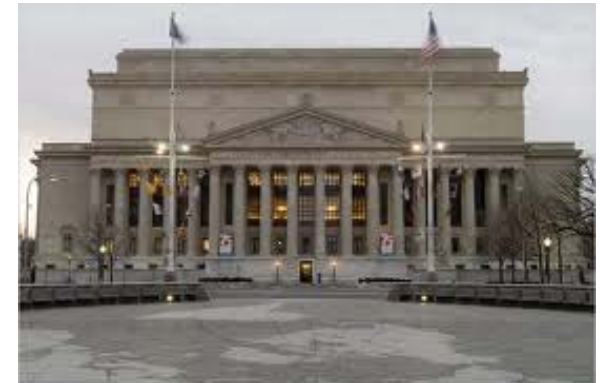
Pennsylvania Ave Entrance at the National Archives at Washington, DC