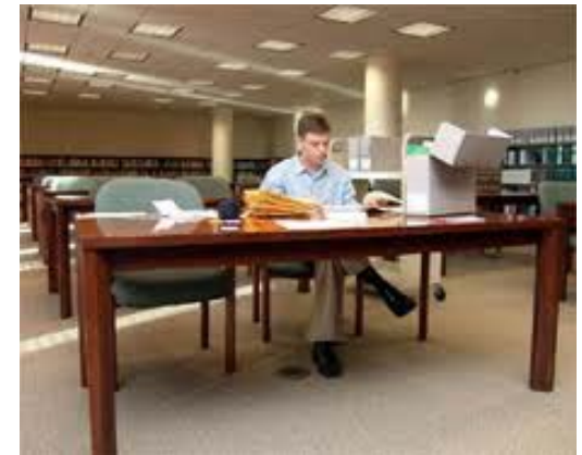
Ronald Reagan Presidential Library Simi Valley, CA