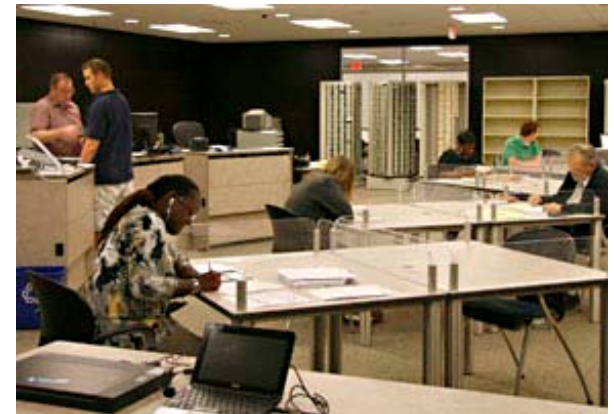
National Personnel Records Center National Archives at St Louis, MO