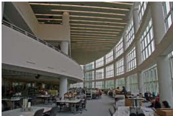
Research Complex at the National Archives at College Park, MD