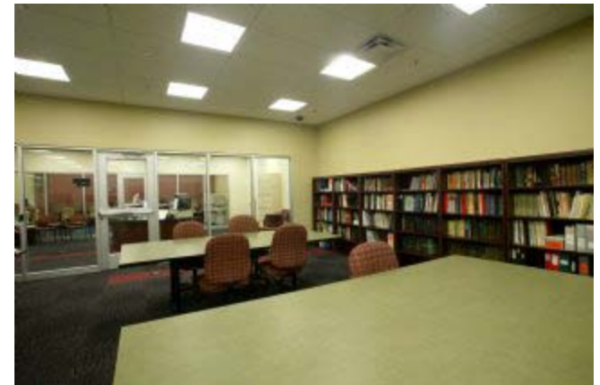
National Archives at Kansas City, MO

Remember, you help us protect the records: