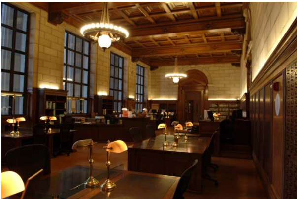
Research Room National Archives at Washington, DC