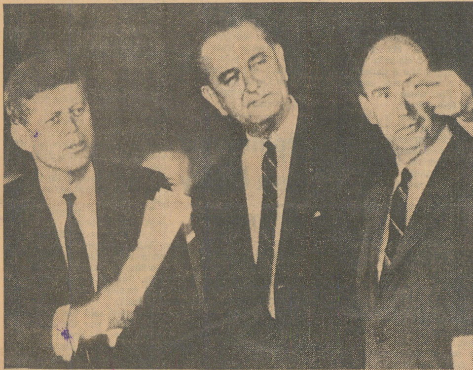
'THIS WAY, ADLAI'—Sen. Lyndon B. Johnson tries to get Adlai Stevenson to look toward Sen. John F. Kennedy while they posed for pictures in the Los Angeles Coliseum where