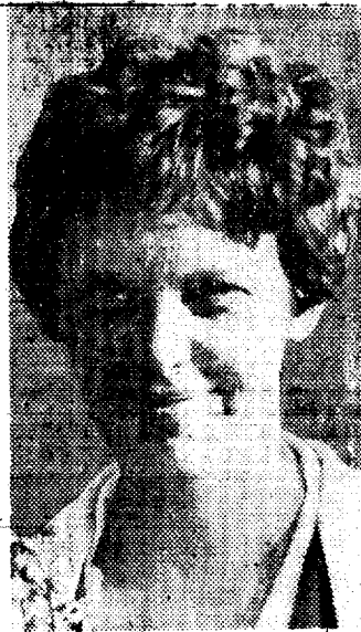
Amelia Earhart