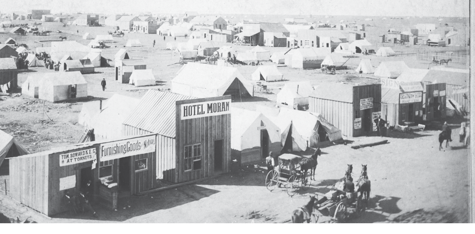
Opposite: In 1887, Congress made more land available by opening the remaining Indian lands to settlers. A poster advertises the opening, which led to the "land rush" in Oklahoma. Above: The Oklahoma District was opened for settlement at noon on April 22, 1889, and new towns like Guthrie (above in 1893) arose quickly.

California, Washington, and Oregon were opened to cash purchase, and great landed estates were established in this way.