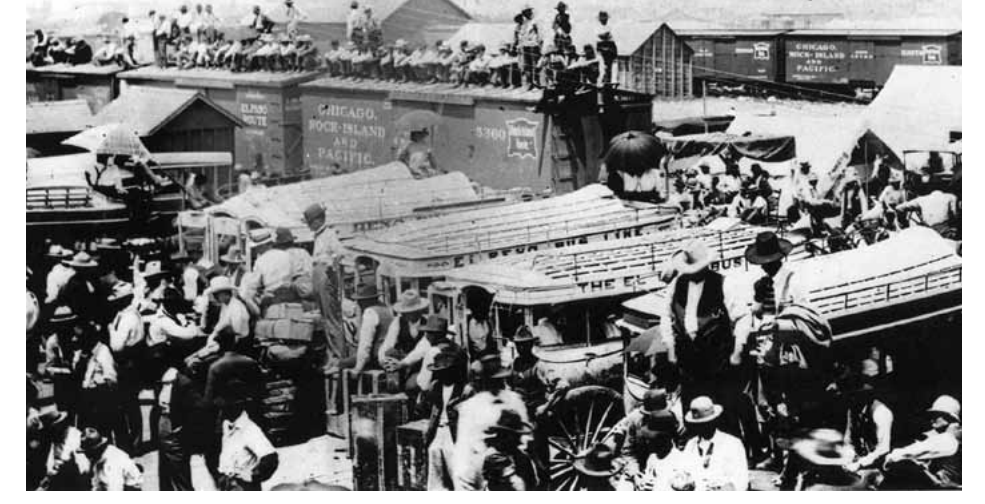
Above: Thousands of settlers waited at Kiowa, Oklahoma, on July 29, 1901, amid freight cars and wagons for a drawing for the right to homestead. Other sections were opened to land rushes. Below: Homesteaders in New Mexico, undated. Although much of the better land had been acquired between 1862 and 1890, good land in the West still remained, and the westward movement continued after 1890.